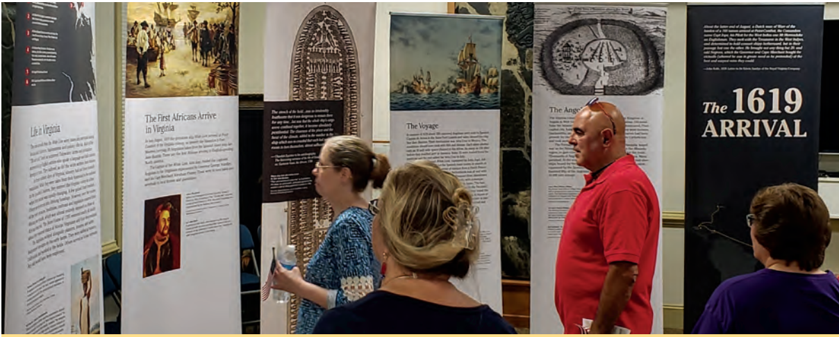
In July we hosted two traveling exhibitions as part of our 2019 programs that commemorated the historic events of 1619 Virginia: the Hampton History Museum's 1619: Arrival of the First Africans (shown here) and American Evolution's The Great Charter and the General Assembly: Founding a Legacy in 1619.