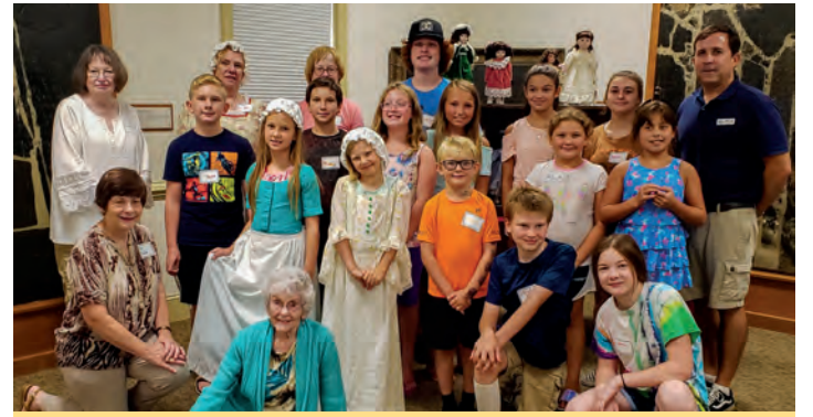
Above: 14 youngsters participated in our Hands-On History Camp, where they made bricks, wrote with quill pens, took grave rubbings, made candles and baskets, created colonial silhouettes, dug for artifacts, played colonial games and more. Here participants gather with members of the HCC&M Education Committee, who led the three-day camp.