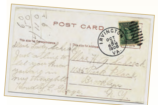
Postcard from the Chase Collection dated October 21, 1908

In April of 2009, Dr. Chase helped dedicate the new Chase Center as part of FHCC's 50th Anniversary Campaign. Fittingly, his postcard collection is on display in the Chase Center's conference room, framed in clear plexiglass panels that allow viewers to see the image on the front of the card and any messages inscribed on the back.