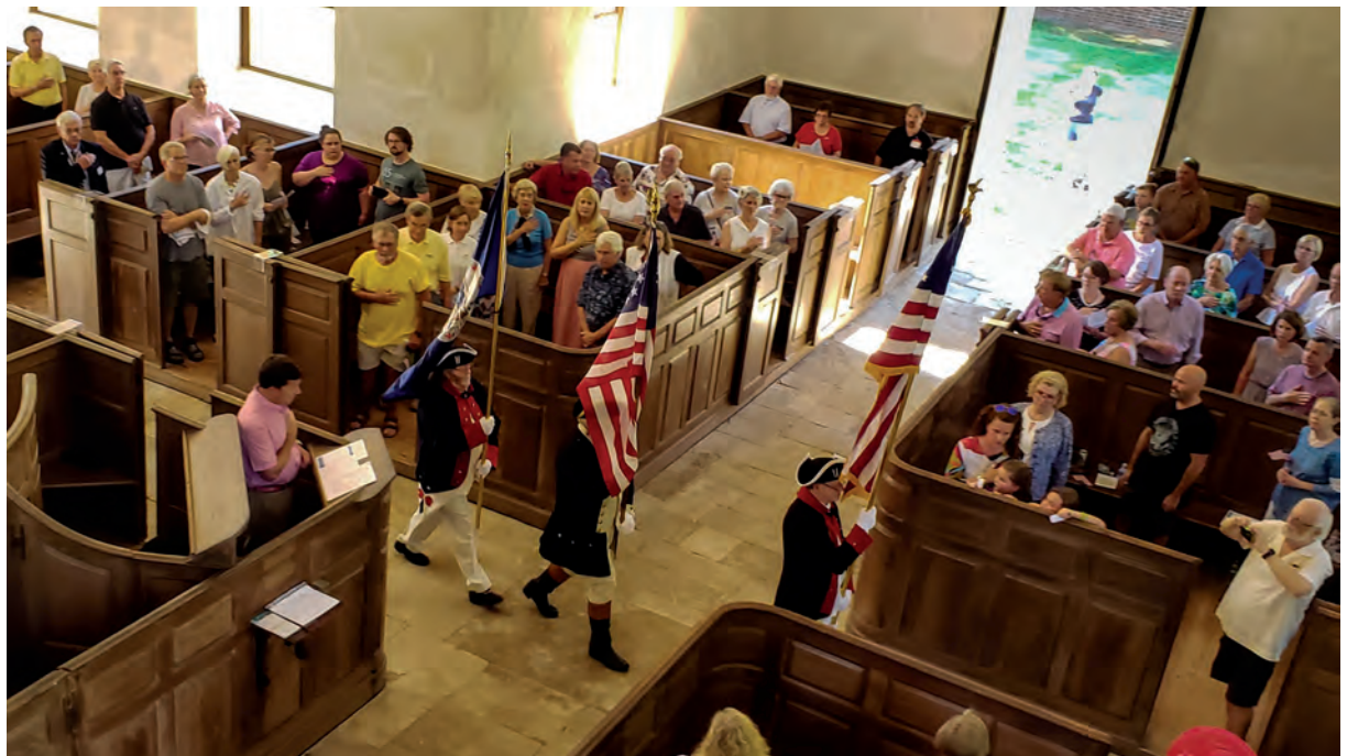
The community enjoyed a patriotic service and music during the 2nd Annual Public Reading of the Declaration of Independence on July 3.